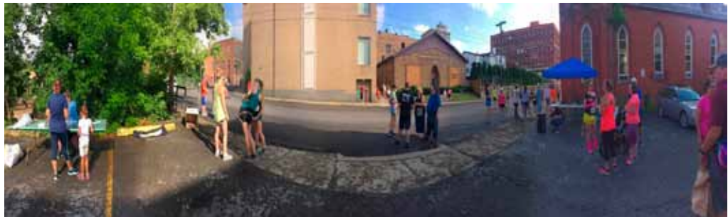
Awaiting the start of the race.