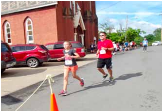
Father and daughter finish together!